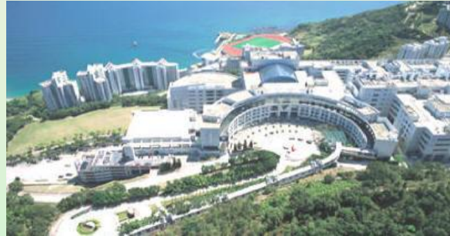
Aerial view of HKUST campus