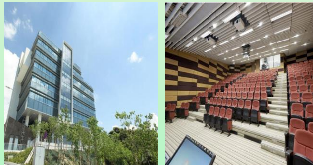
Institute of Advanced Study (IAS) and lecture theatre